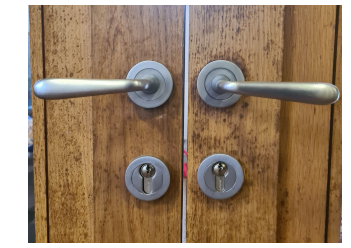
Ironmongery to match existing