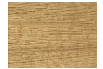
Proposed european oak finish to match existing